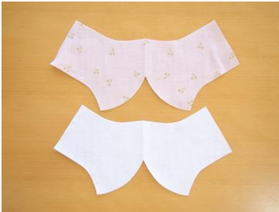
5. Two pieces should look like this.