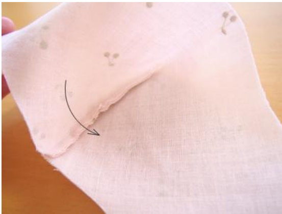
7. Open and iron the seam to the right side.