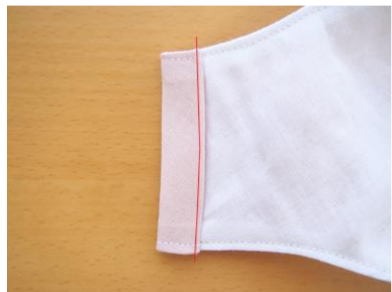
16. Stitch it down with a 2mm seam.