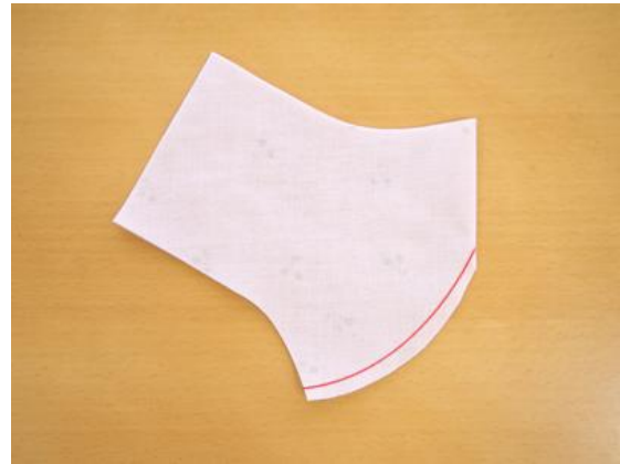
6. Fold the outer fabric right side inside and sew the red line with a 5mm seam