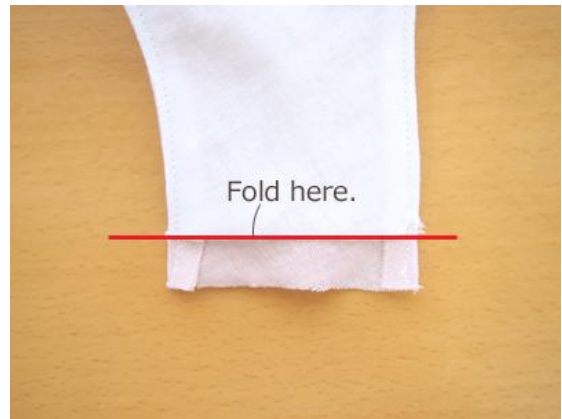
14. Fold the sides toward the inner side about 1.5cm.