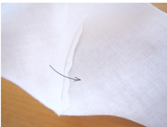
9. Open and iron the seam to the right side.