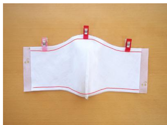
10. Layer the outer and inner pieces right sides together and pin them. Sew the red lines with a 7mm seam.