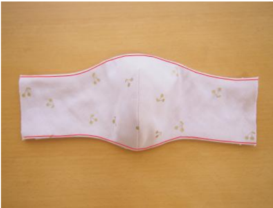
13. After ironing, stitch the rims with a 3mm seam.