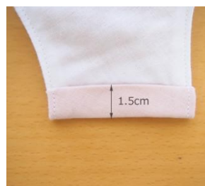
15. Fold it again so that the elastic sleeve is about 1.5cm.