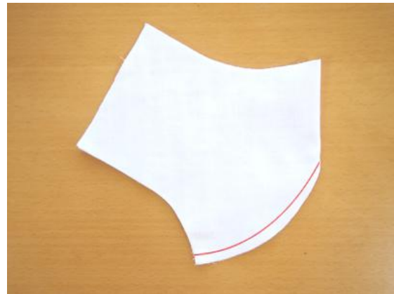
8. Do the same for the inner fabric.